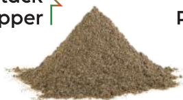
Ground White Pepper