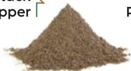
Ground White Pepper